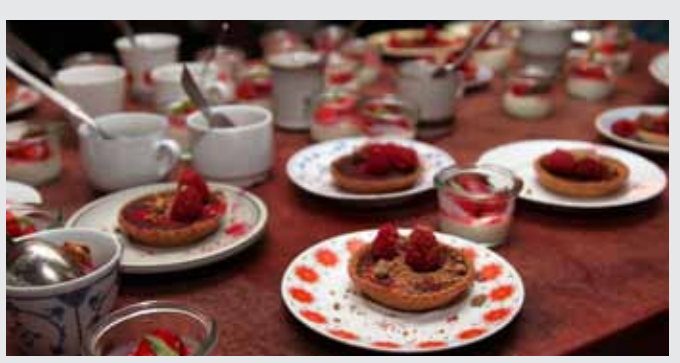
MAY 2012 - NORDIC KITCHEN PARTY AT THE CANNES FILM FESTIVAL.

FARMER SEEKS A CHEF – event organised by New Nordic Food II, Åland, bringing together local food producers and chefs.