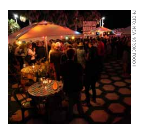
NORDIC KITCHEN PARTY WAS STAGED TO STRENGTHEN THE NORDIC FILM INDUSTRY'S PRESENCE AT CANNES FILM FESTIVAL IN

Furthermore, Nordic cuisine was present at Cannes Film Festival in May 2012. Nordic Kitchen Party was staged to strengthen the Nordic film industry's presence at the festival and set the scene for networking and business negotiations