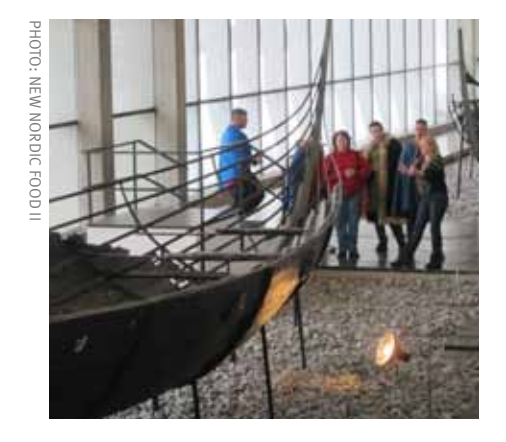
NEW NORDIC FOOD II AIMS TO INCREASE USE OF FOOD IN MUSEUM ACTIVITIES AND OTHER DESTINATION DEVELOPMENT.

Nordic cuisine has become an important factor in attracting tourists to the region. New Nordic Food II encourages cooperation between the countries to strengthen the common gastronomic profile even further and optimise the use of it as a selling point in tourism.