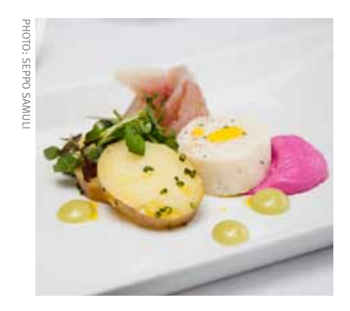
A MEAL IS AN EXPERIENCE, AND LIKE OTHER EXPERIENCES, IT CAN BE DESIGNED.