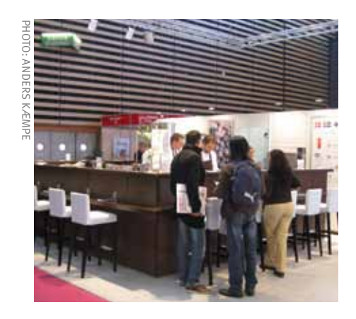
THE NORDIC STAND WAS ORGANISED BY NEW NORDIC FOOD II AND THE SWEDISH, FINNISH AND DANISH EMBASSIES IN FRANCE.

The Nordic stand at SIRHA 2011 in Lyon, an international food service fair held in conjunction with the world's most prestigious chef competition, Bocuse d'Or, is a good example of successful joint Nordic food promotion initiatives.