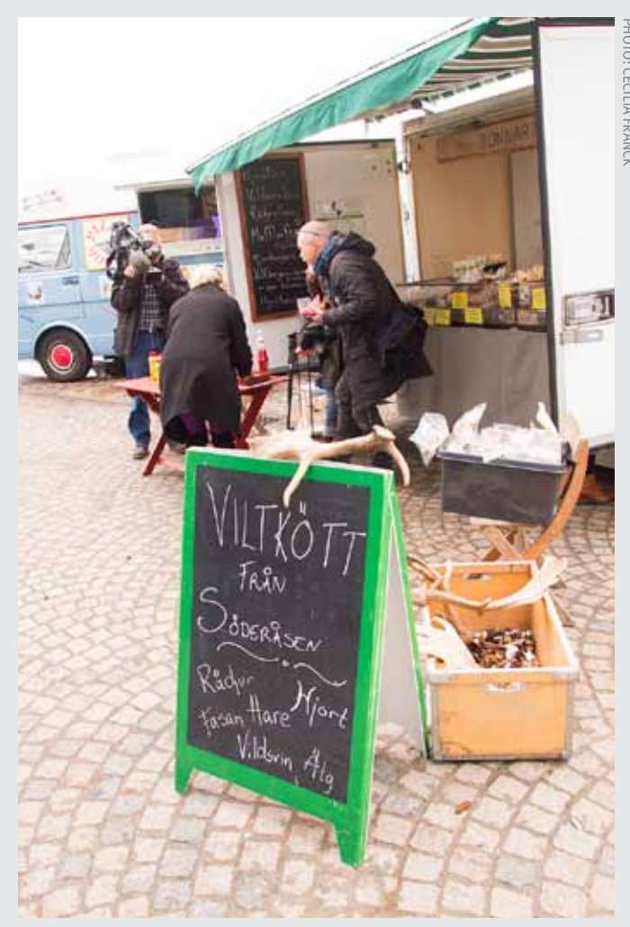
FEBRUARY 2013 – CONFERENCE ON NORDIC STREET FOOD IN MALMÖ, SWEDEN.

NORDIC COOL FESTIVAL IN WASHINGTON, organised by the Kennedy Center in cooperation with the Nordic embassies. Food and Creative industries participates in the event, which is supported by the Nordic Council of Ministers.